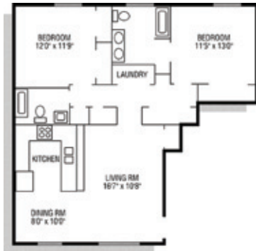
2 Bedroom Luxury A 915 sq ft