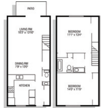
2 Bedroom Townhouse 1150 sq ft