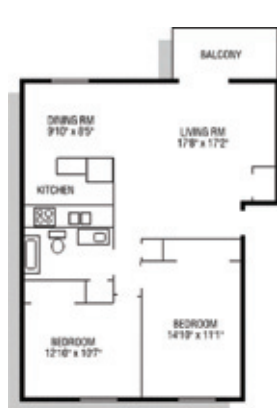
2 Bedroom Deluxe 935 sq ft