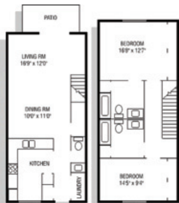
2 Bedroom Deluxe Townhouse 1260 sq ft