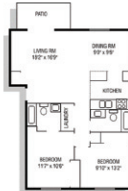
2 Bedroom Luxury B 920 sq ft