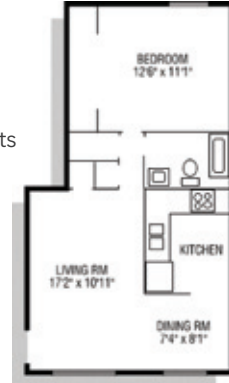
1 Bedroom Standard 560 sq ft