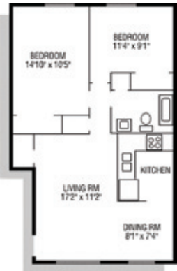
2 Bedroom Standard 700 sq ft